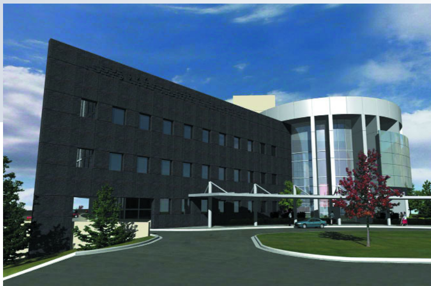
View of the new building and atrium from Stanton L. Young Boulevard

Gifts to the Dean A. McGee Eye Institute Foundation can be restricted to vision research, patient care, medical education or the Capital Campaign. Alternatively, your gifts can be unrestricted, making funds available where the Eye Institute has its greatest need. The attached self-addressed return envelope has been included to provide you with an easy way to make a gift to the Foundation. After your gift has been processed, we will send you an acknowledgement and receipt for your records. ▲