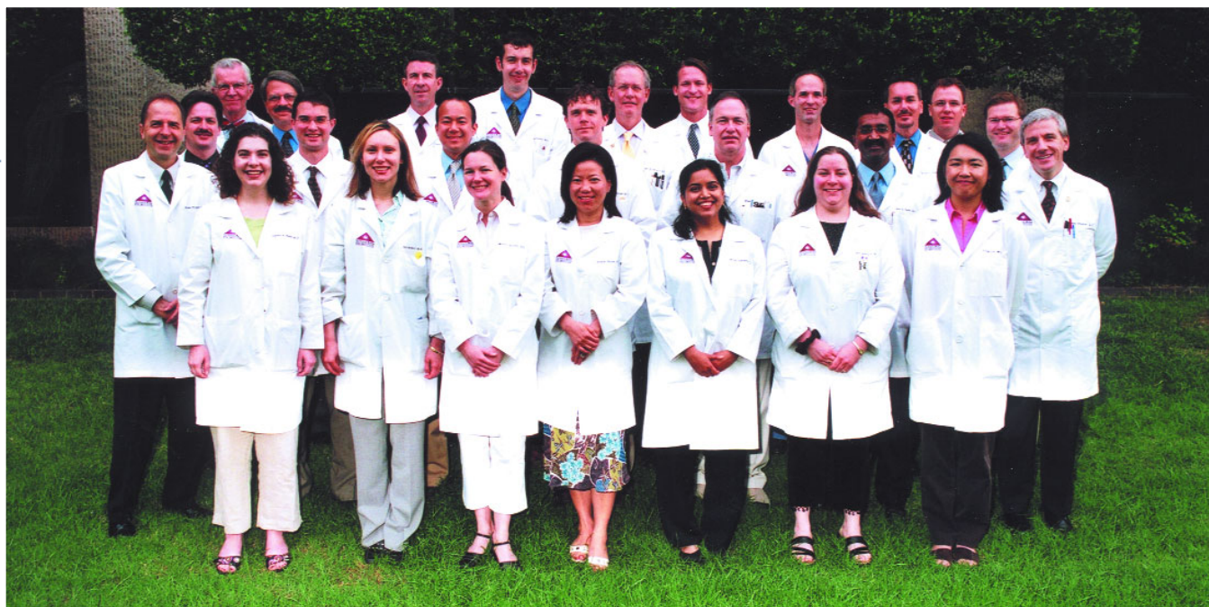
DMEI Residents, Clinical Fellows, and Faculty Ophthalmologists