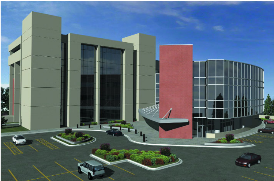
View of the new and old buildings from the patient parking lot – architect's rendering