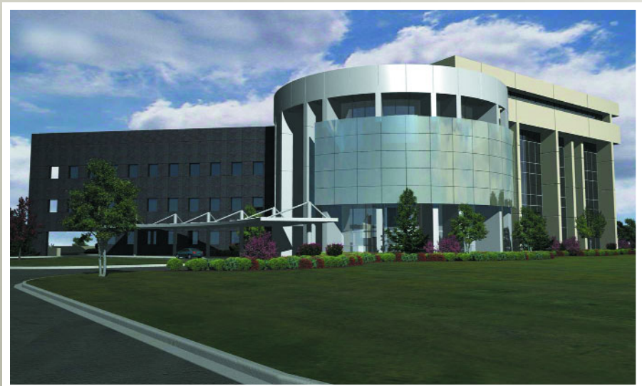
New Dean McGee Eye Institute building – architect's rendering

The Dean McGee Eye Institute is now home to 29 ophthalmologists, two optometrists, one ocularist (a professional who makes and fits artificial eyes), 12 vision research laboratories, and 250 other members of the Institute staff. Nearly 140,000 patient visits will be recorded in 2005. Over 20,000 of those visits will be made by patients unable to pay for the care they need – patients