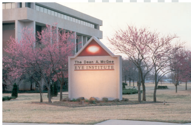
Dean A. McGee Eye Institute

Gifts to the Dean A. McGee Eye Institute Foundation can be restricted to vision research, patient care or medical education. Alternatively, your gifts can be unrestricted, making funds available where the Eye Institute has its greatest need. The attached self-addressed return envelope has been included to provide you with an easy way to make a gift to the Foundation. After your gift has been processed, we will send you an acknowledgement and receipt for your records. ▲