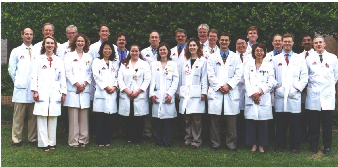
DMEI Residents, Clinical Fellows, and Faculty Ophthalmologists